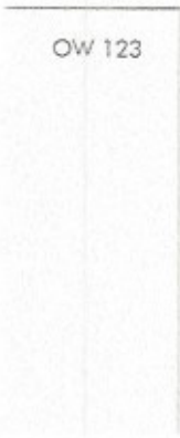
OW 123 SC - OW 123 Angel Cloud