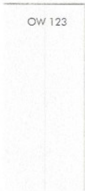
OW 123 SC - OW 123 Angel Cloud