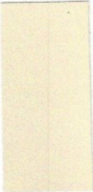
SW - 6365 Cachet Cream