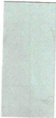
SW - 6247 Krypton