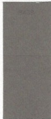
SC - 8438 Castle Dale