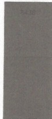
SC - 8438 Castle Dale