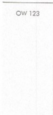
SC - OW 123 Angel Cloud